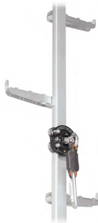
Fig.1. Assembly of the union

CE conformity number 0082/1084/160/11/0310