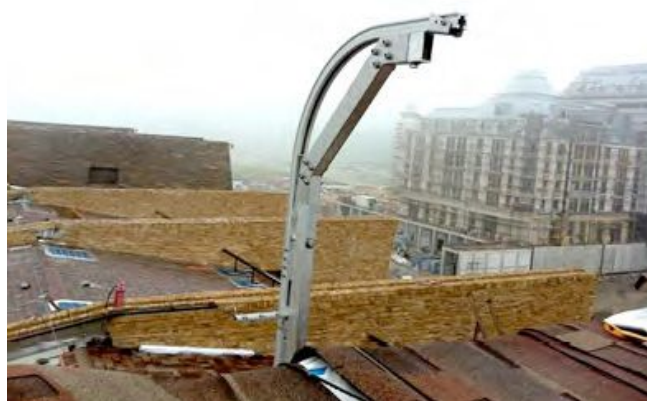
RHF025 Extension for roof access alu 6060T6