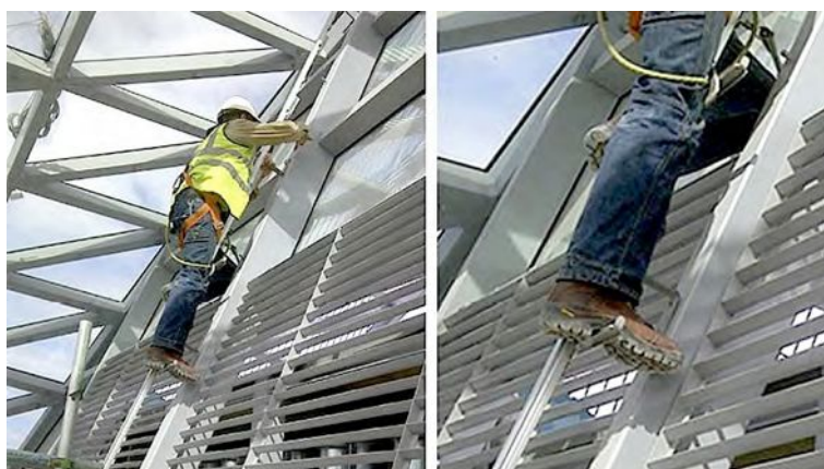
Worker operating on the ladder