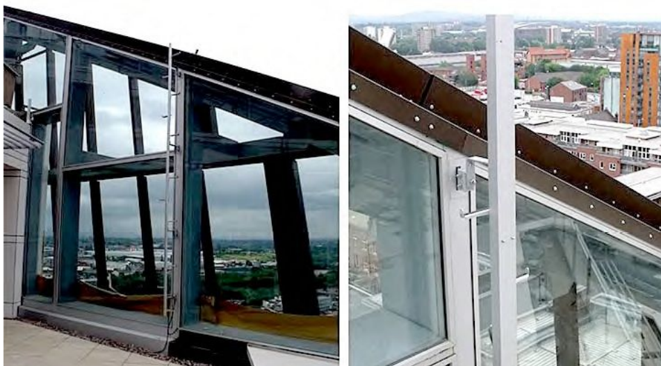
RHF030: aesthetic solution integrated to the façade